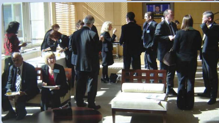
Lunch in the atrium.