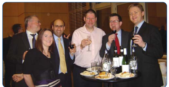
BLG A team.